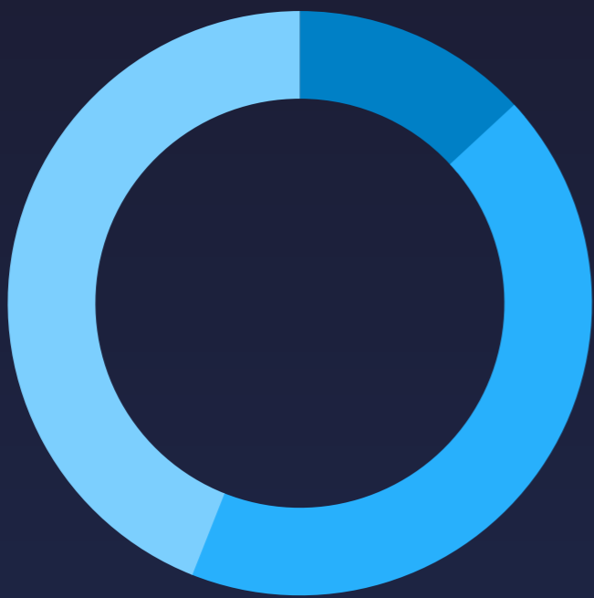
Share of Viewers by Preference for Exclusive/Generally Available Content